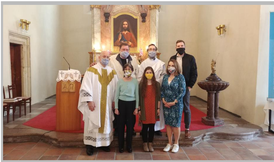
Our church in Prague resumed services in May, with restrictions, such as wearing facemasks. Our entire mission team from throughout the Czech Republic attended one of the first services.

So, what can you do when life changes drastically because of a virus? Pray.