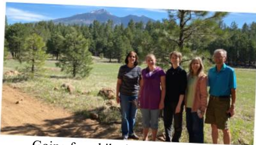
Going for a hike in the mountains