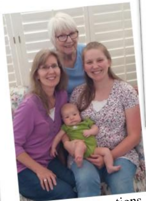
The four generations