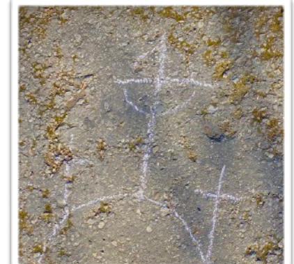
Walking in the nearby forest (getting slightly lost), I see the trees coming to life and reminders of the Passion story on the path.