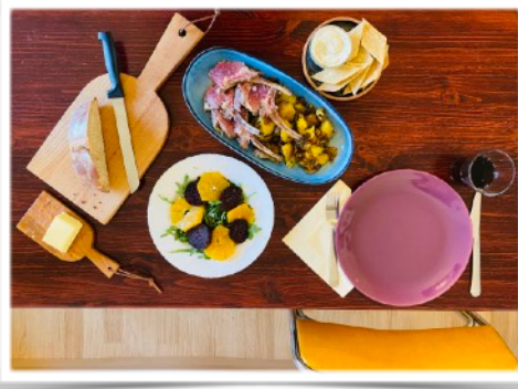
On my table sits only one plate for Easter lunch, so different from years past.

And as I sat and thought more about it, this Easter wasn't so different after all.