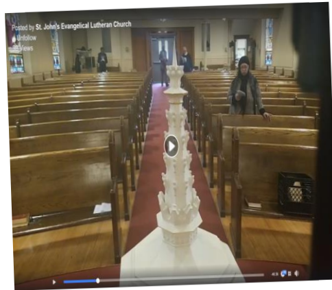
Image from live stream of Sunday Morning Divine Service at St. John’s Evangelical Lutheran Church on 5/10/2020.

Many did enjoy the worship service as it was being broadcast on Facebook, and still others watched the sermon when it was rebroadcast on YouTube, both in Gary and throughout the country, it felt good to be inside the sanctuary for that hour.