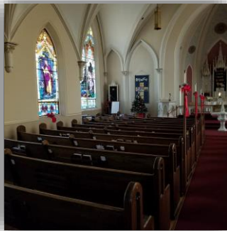
Interior of St. John's Evangelical Lutheran Church of Gary, IN