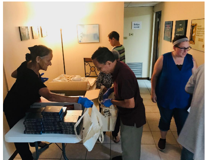
Packing bags at Fuente de Vida of hand sanitizer, soap, and a Bible. These are now being distributed by our neighbors (local pharmacy).