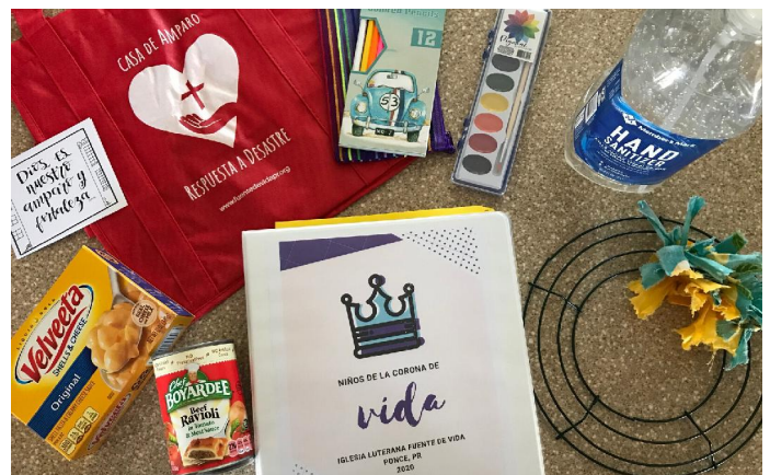
Sunday School Packet with extra crafts and food.