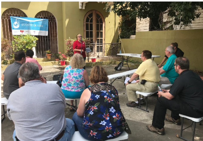
March 2020 Puerto Rico Foro