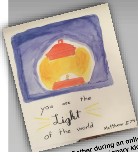
Art made by Esther during an online Bible class for the missionary kids