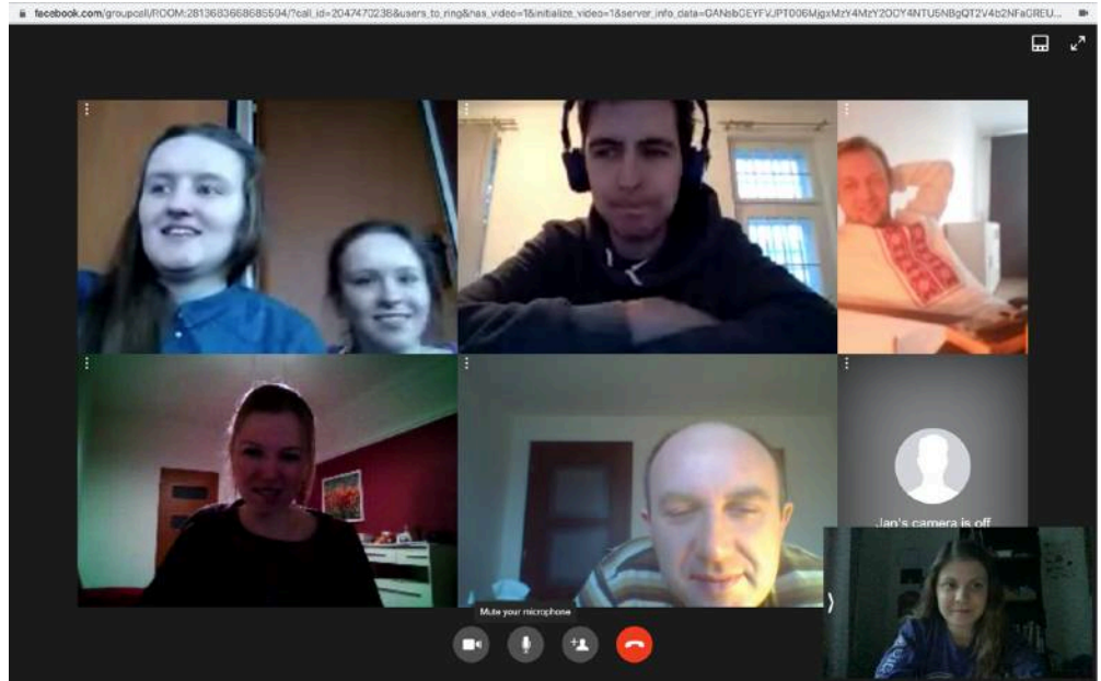
Above: A snapshot of one of our online youth meetings.

Our youth group has met online for about a month now. Each week we gather in fellowship, have a small worship time, share a devotion, and play a game together. Keeping our community is crucial as we share the Gospel with the students, and we pray that God will continue shaping and molding their hearts for Him. As we move from in person to online, I see what a blessing technology can be as well as the strong value we place in face to face meetings. What a joyous reunion we will have when we are all able to worship together again!