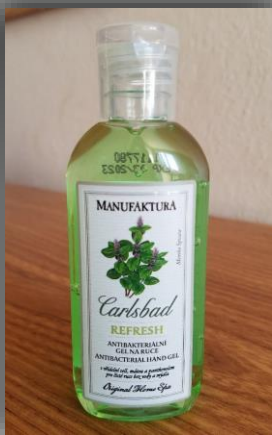
A local Czech company, Manufaktura, has plenty of hand sanitizer available.