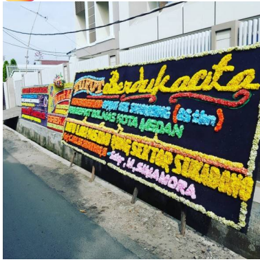
Popular flower boards had us scratching our heads as we confused the Indonesian words for mourning and joy. Read more at theseaside.asia