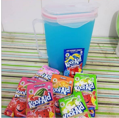
We were probably a little too excited about some of the contents of this care package we received in January.