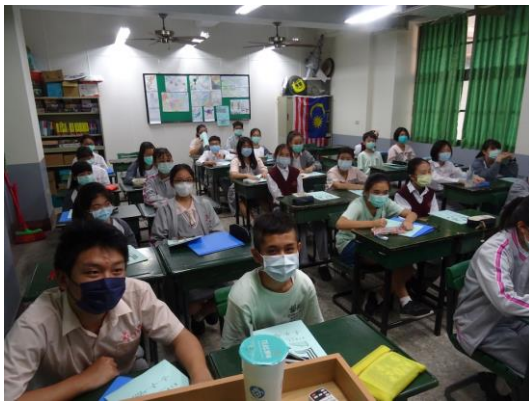
7 th Grade class all wearing masks.

So what will come next? We pray that God will grant us the peace and comfort of knowing HE IS in control. We pray that God will grant us the encouragement and endurance of knowing he cares and hurts with us. We pray that God will grant us the boldness to share His Words of comfort, peace, and control to others in this time. May He be glorified even in uncertain times!