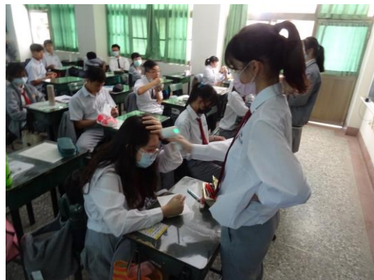
10 th graders taking temperatures after lunch, before the nap time.