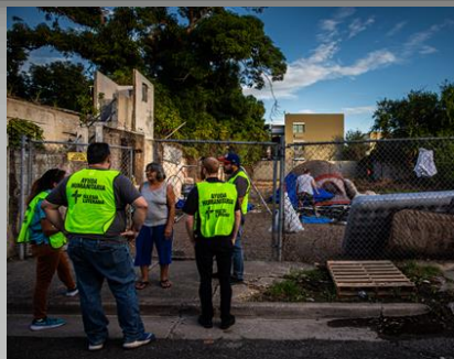
The missionary team in Puerto Rico, provide care to the community.