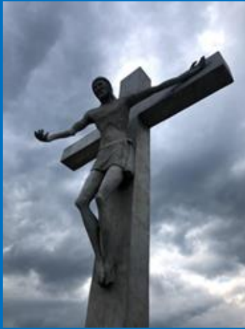
Statue at the Botanical Garden in Santiago