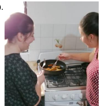
Above: Spanish Excursion to the Oscar de la Renta Exhibit Right: Cooking Tostones

language barrier is a big challenge in building these relationships. There are times after church or other events that people are in groups talking to each other. I pray that I am able to talk with them more than just basic phrases such as “Hola, ¿como estás? Yo estoy aprendiendo Español”. (“Hello, how are you? I am learning Spanish.”). I am grateful for the time I have in classes and I am slowly improving my language skills. In Spanish we say “poco a poco”. (little by little).