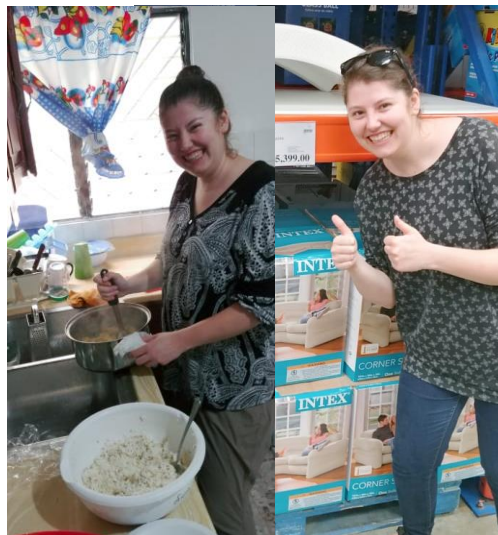
Left: Cooking Mangú (a tradition DR Dish. Similar to mash potatoes made with plantains)

have to use a new currency that looks like monopoly money in my wallet. All the labels are in Spanish, meaning I have to pay extra attention in order to ensure I am getting the things I need. There is no such thing as a quick 5-minute trip to the grocery store. It takes that long or longer just to get to the store. Mundane tasks may take longer and be more difficult here, but it is always an adventure and I am thankful that my missionary friends are making the adjustment easier. I am excited to continue learning and adjusting to a new a place.