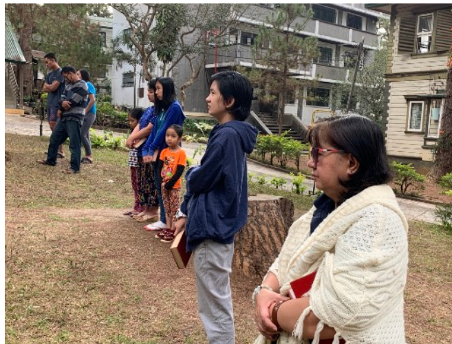
Daily prayers in the campus quad.