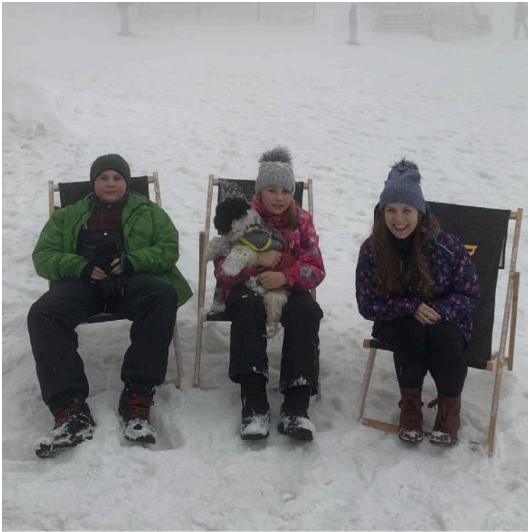
Above: My pastor's children and I in the Beskidy mountains on the Czech/Polish border.

Here are some other highlights from my first couple weeks in Bohumín!