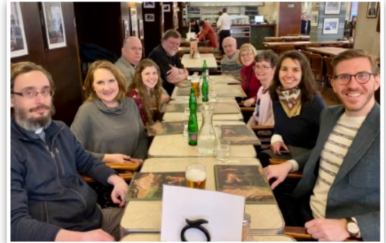
Gathering for lunch in Prague as a Czech missionary team following the Divine Service at St. Michael's Lutheran Church.

Take shelter in the Lord and in each other. Surround yourself with those who encourage you. And continue to point each other back to the cross.