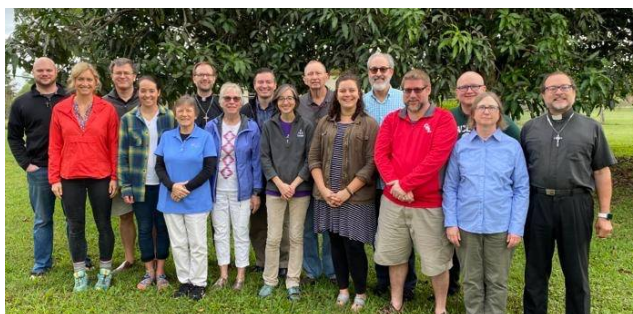
The LAC Regional Leadership Team

The verses above from the close of 1 Thessalonians are a final plea to the people to come together in one another's joys, prayers, and thanksgivings as the body of Christ, because it is the will of our Father. This first month of January has been a testament to that plea, in leadership meetings, disaster response, and also in my personal life. I have seen the body of Christ come together in rejoicing, in prayer, and in thanksgiving to our God, according to His will, in many and varied circumstances.