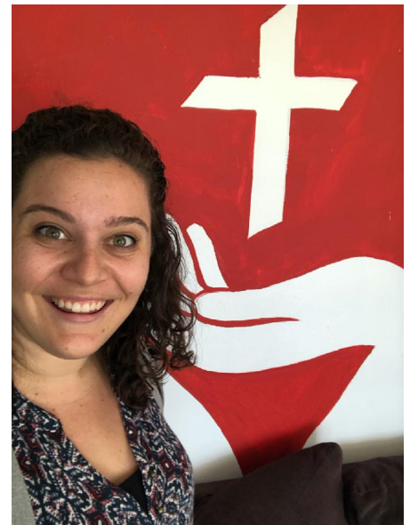
Visiting the church and CARD House in Mavaquez, Puerto Rico

THANK YOU for your part in holding up the prophets' hands."