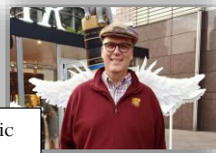
Showing his angelic side