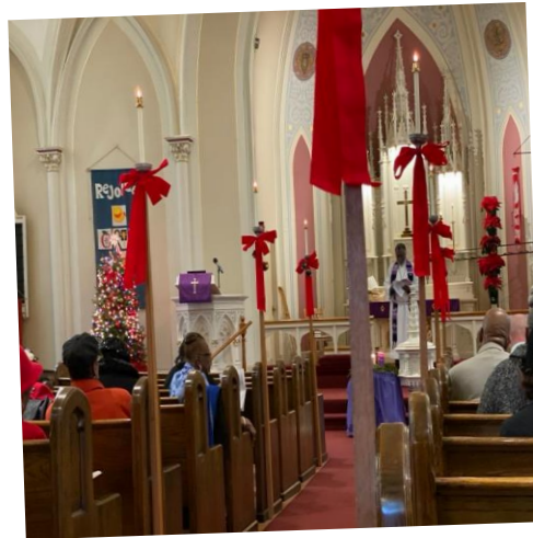
Advent 3 Divine Service at St. John's Evangelical Lutheran Church 12/15/2019

there are many wonderful memories connected to each building. One point that we have stressed is that the coming together doesn't have to mean the loss of any of the current structures.