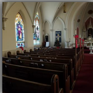
Interior of St. John's Evangelical Lutheran Church of Garv. IN

We envision a city that is attractive, inviting, and thriving, based upon Agape Love In Action (ALIA).