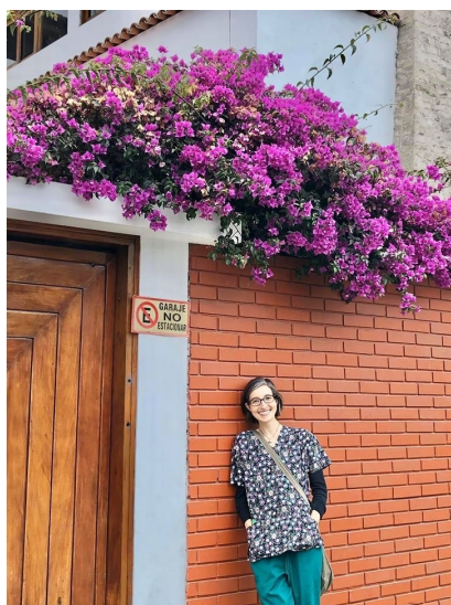
Stopping to smell the...bougainvillea...on an afternoon stroll through San Borja, Lima, Peru.

Suffering is inevitable, but with the "faithful Creator" on my side, there's no time for idleness!