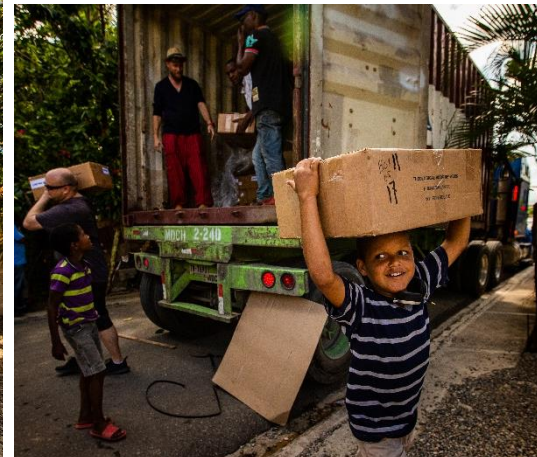
Photos: Unloading of the truck with our Seminary Library books!