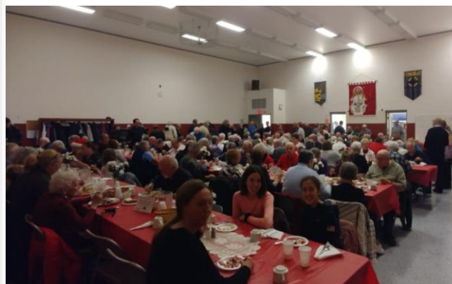
Photo: Turkey dinner at Good Shepherd