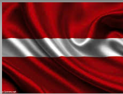
The Latvian National Flag