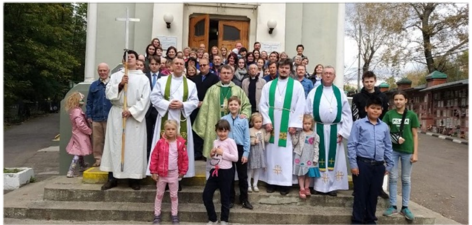
Members of Holy Trinity, Moscow gather outside their church on the 20th Anniversary of the church's restoration and renovation.