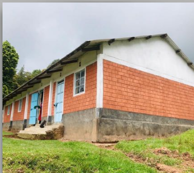
New Project 24 site