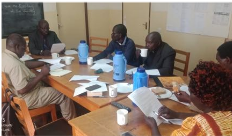
The Catechetical Club Board Members meeting with the principal of Neema Lutheran College