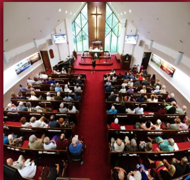
Photo: Tirzah presenting after service at First Lutheran – Kingsville ON