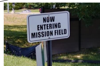
Photo: Taken outside of Our Savior- Fenton, MO