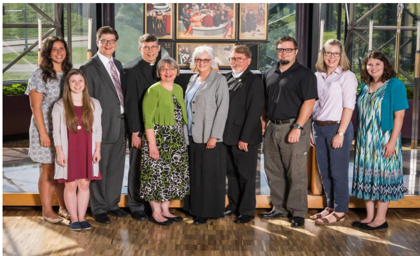
Photo: Group picture during August Missionary orientation.