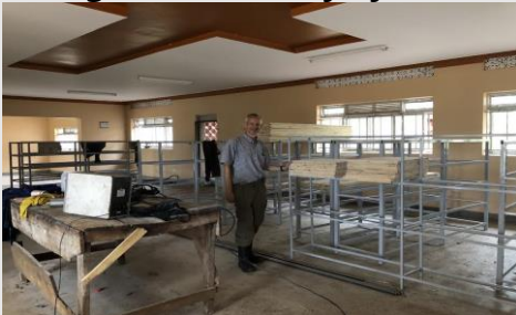
LTCU library takes shape