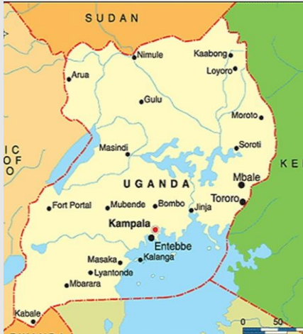
Uganda-Pearl of Africa