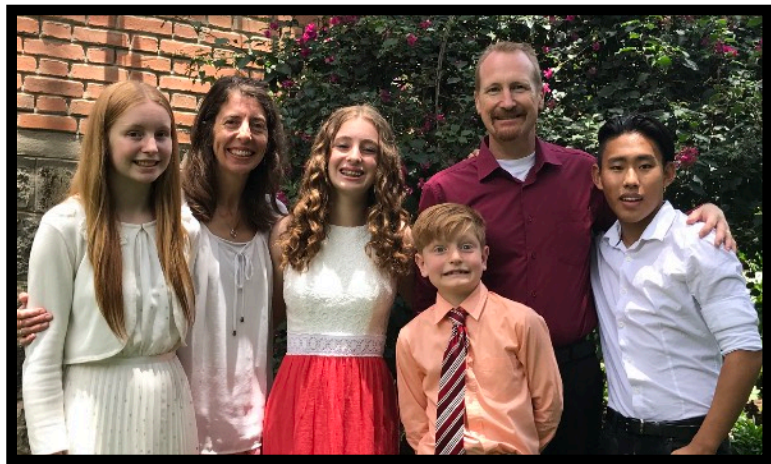
We continue to thank God for the blessing of serving in Ethiopia knowing that your prayers and support enable us to serve on your behalf.

“Blessed be the God and Father of our Lord Jesus Christ! According to his great mercy, he has caused us to be born again to a living hope through the Resurrection of Jesus Christ from the dead...”—1 Peter 1:3