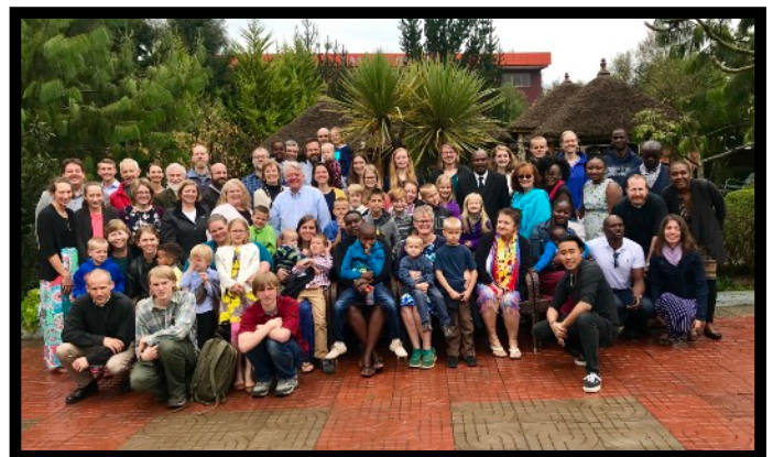
The east Africa Missionaries, staff and their families

During our continuing education time we are blessed to enjoy one of the two times a year that our entire east Africa missionary team is together. During the three days together, we are able to visit with each other, pray and worship together and enjoy the community of fellow missionaries. For the kids, it is a wonderful time for them to be with friends. Many of the kids have been friends since missionary orientation almost five years ago. It was truly a time of refreshment in God's word and in community.