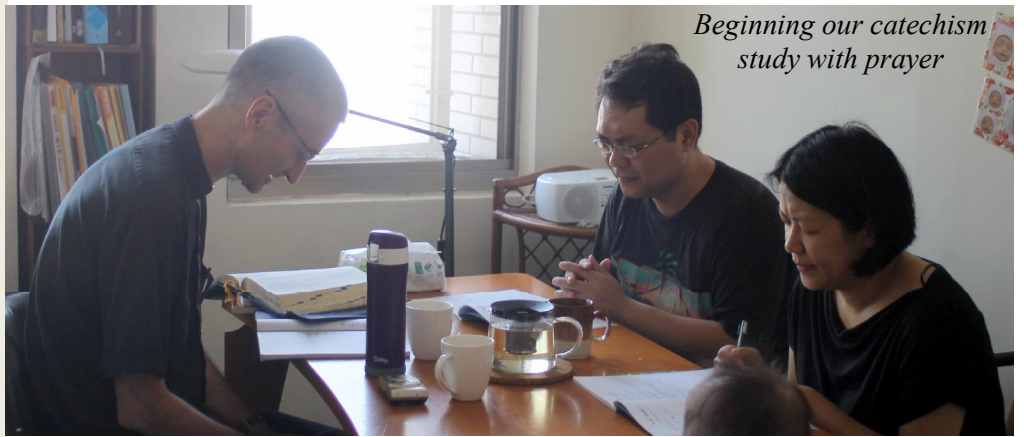
Beginning our catechism study with prayer

There are many opportunities to serve as short-term or GEO missionaries. Check out the current list and download an application at www.lcms.org/service . Click on "Service Opportunities."