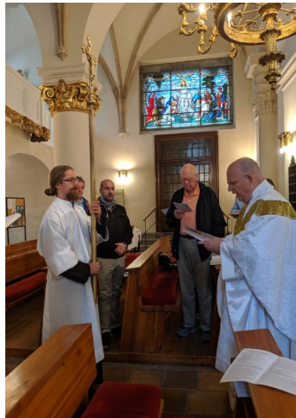
The Holy Gospel is read for St. Michael's Day