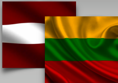
The national flags of Latvia (left) and Lithuania (right).