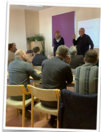
The seminar at St. Gregor’s

So, I told them how a friend of mine, (recently retired) kept a slip of paper in the pulpit where he could see it every time he stood there. The paper said, “ The Gospel Assumed is the Gospel