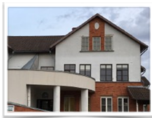
St. Gregor’s center, Saldus