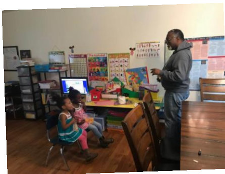
All that and teaching too!