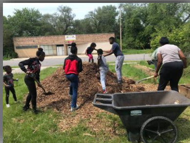
St. John's people work with neighbors in the garden.