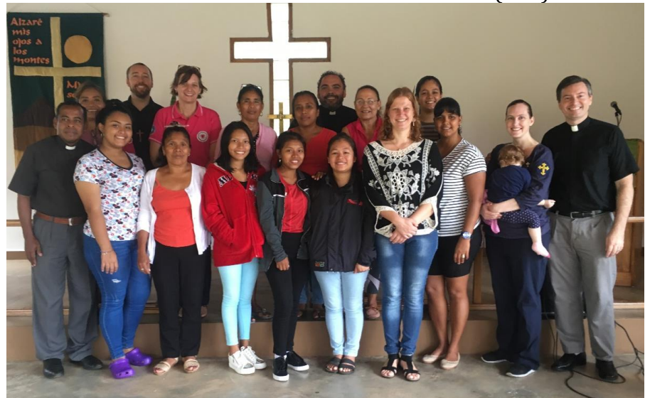
Above: Diaconess Students in Panama

“The harvest is plentiful, but the laborers are few. Therefore pray earnestly to the Lord of the harvest to send out laborers into his harvest.” Luke 10:2 (ESV)