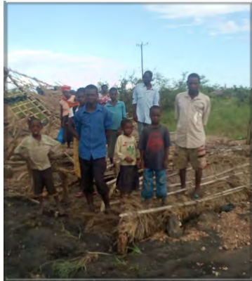
Theological student and his family in front of their home after Cyclone Idai hit Mozambique