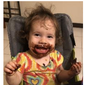
See the chocolate cake above? That was the "before" picture. This is "after!"

Once we've established that respect for what we see and hear around us, then people are much more willing to listen to us: to the songs that we sing and the words we share about why we would leave the US and establish our home over here. What a joy! Christ is risen indeed, Alleluia!