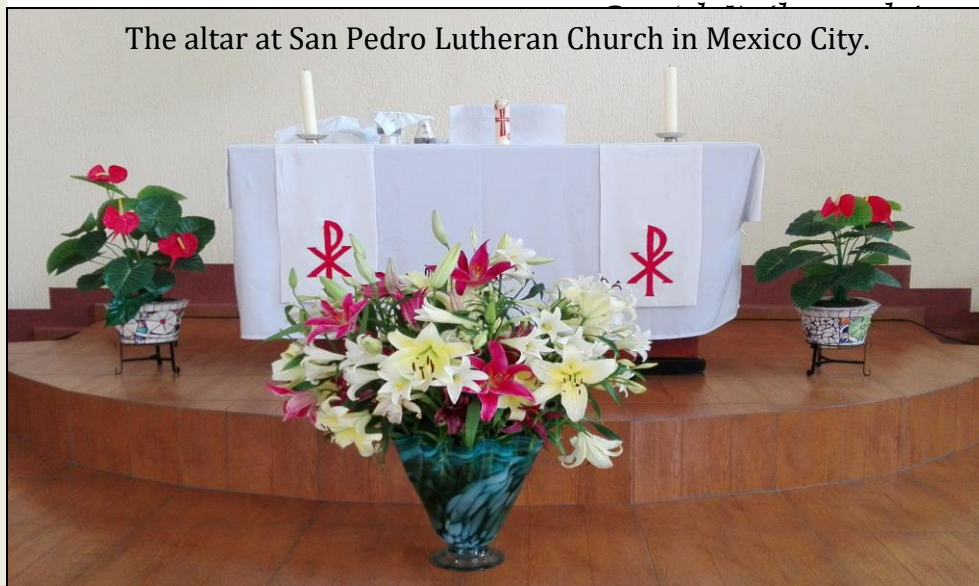
The altar at San Pedro Lutheran Church in Mexico City.

To support our work financially, you may send a tax-deductible gift to: