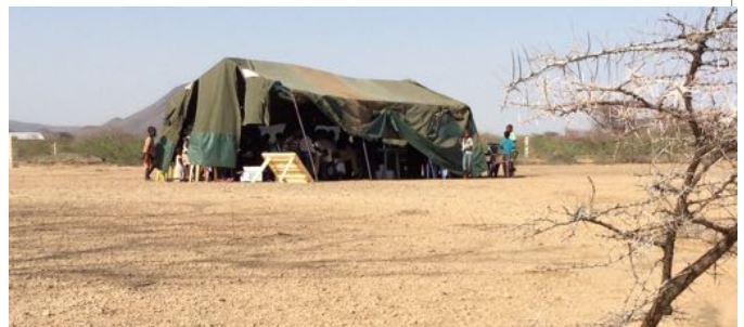
MIDDLE: Children and families gather as we share and sing about Christ.