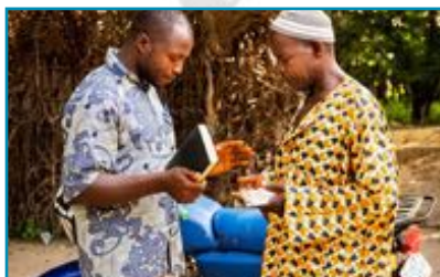
Urban Ministry, one of many new African projects in 2019