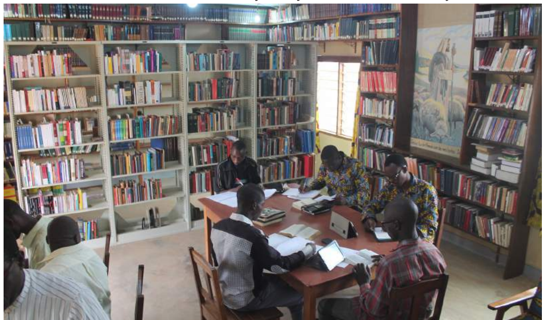
CLET students study in the library under the watchful eye of the Good Shepherd (mural right).

Any good student and sincere teacher will be aware of their own limitations. We all can relate to the teacher in high school or in college who had a great impact on our thought and development in how we approach life and our vocations – be they vocations in the church, or in professional “secular” careers. No good teacher will ever tell their student to simply listen to them and their own presentation of the truth or discipline they teach. A good teacher will guide their students to critique and to research the claims from the classroom to evaluate if they really are true. This is why schools and