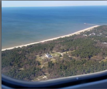
Palanga, Lithuania and the Baltic Sea viewed from the airplane.