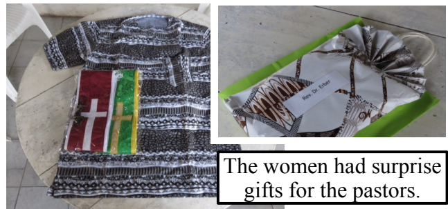
The women had surprise gifts for the pastors.

After the Mother's Day celebration, a couple of women stepped forward and asked for the microphone. They announced that they also had a presentation they wanted to make.