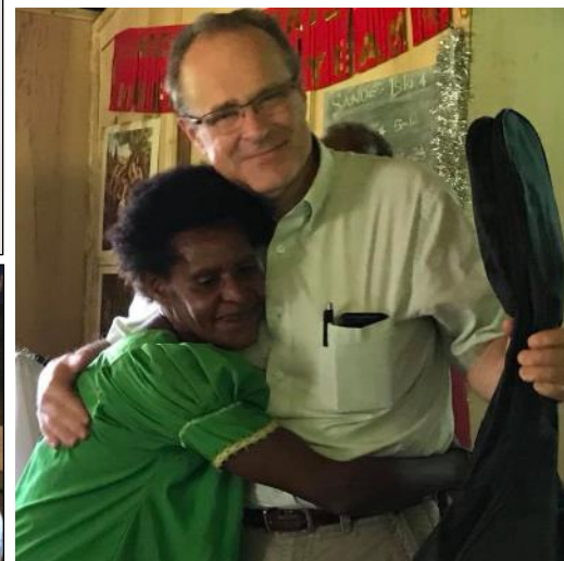
The handout (top left) quotes John 1:29 and Revelation 5:11-12 which reveals that songs to the Lamb of God will be sung eternally. Presenting guitars to churches in the Wabag District who had purchased them (above). Two boys talking about sheep (at left).