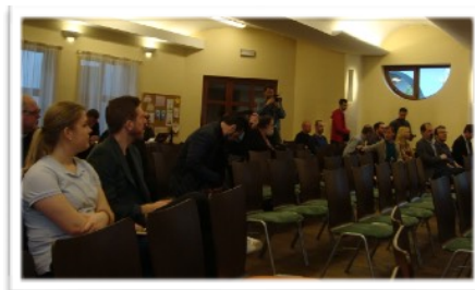
Listening to a presentation in Bystřice, CZ

Last month in Palanga, Lithuania, and in Bystřice, CZ, I presented lectures to two pastoral conferences. In both places, my presentations were translated into various languages—Lithuanian, Czech, Ukrainian—and those listening asked questions and made comments, which were translated back and forth into English, Czech, etc. Learning and discussion shuttled across the divide created at Babel, but overcome by the unifying power of the Gospel.