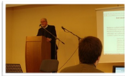
Lecturing on Law & Gospel in Bystřice, CZ

At the Tower of Babel (Gen. 11), God confused human language because of sin. At Pentecost (Acts 2), the Holy Spirit reversed Babel by the miraculous gift of language to the Apostles. Recently, I got to experience how the Gospel continues to bring people together across the divide of language.