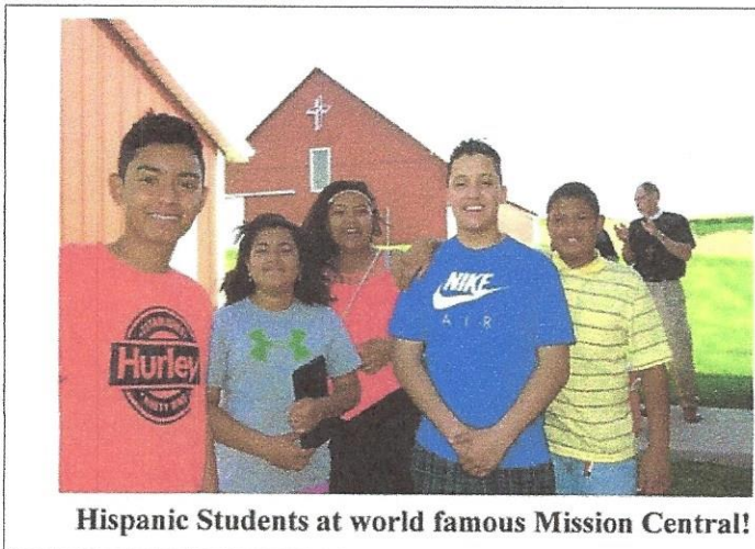
Hispanic Students at world famous Mission Central!