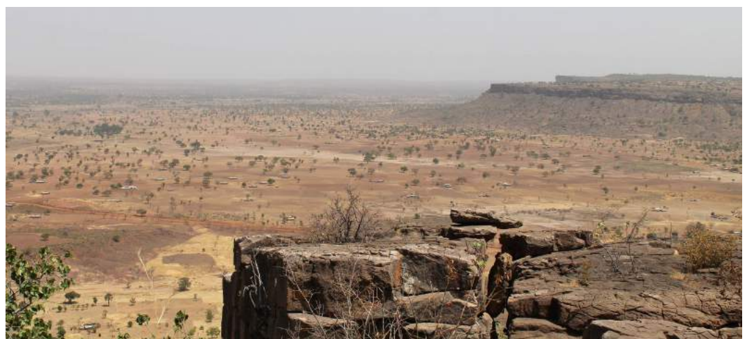
A view from the bluffs overlooking the landscape toward Dapaong in Togo. Note the dry ground and the dust on the horizon.

How different our comfort and security in life is from the daily life in many parts of Africa. Most of the population lives on sustenance farming. They live off of the land they have inherited and they subsist mainly on the